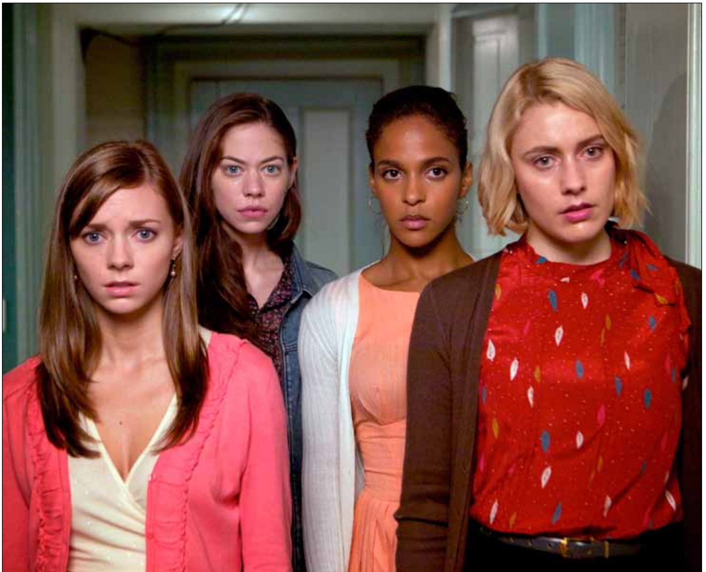
DANSELS IN DISTRESS

INCLUDES OUR MAIN ATTRACTIONS AND SPECIAL PROGRAMS